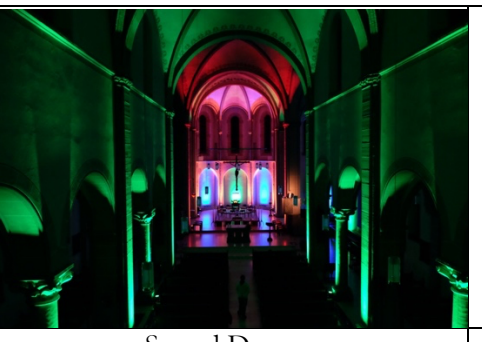
Sacred Drama GOTTESSCHWINGUNGEN St. Severin Church, Germany 2017