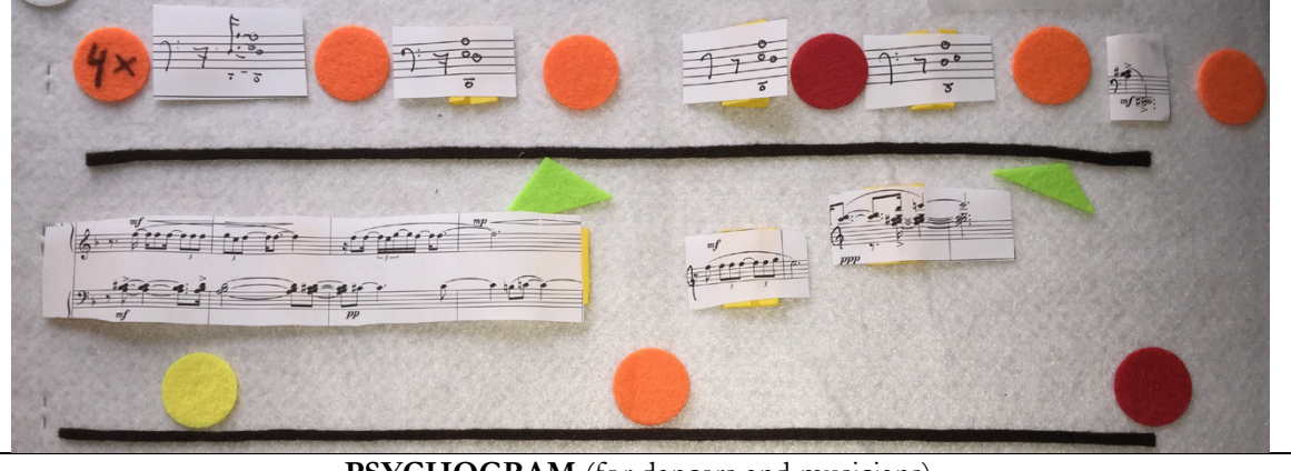
PSYCHOGRAM (for dancers and musicians) Tisch Dance Alumni Concert, Jack Crystal Theater NYC, 2016