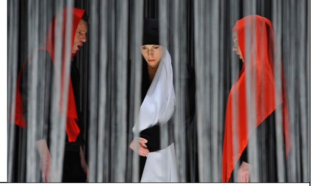
Opera 20 MINUTEN Berlin 2010