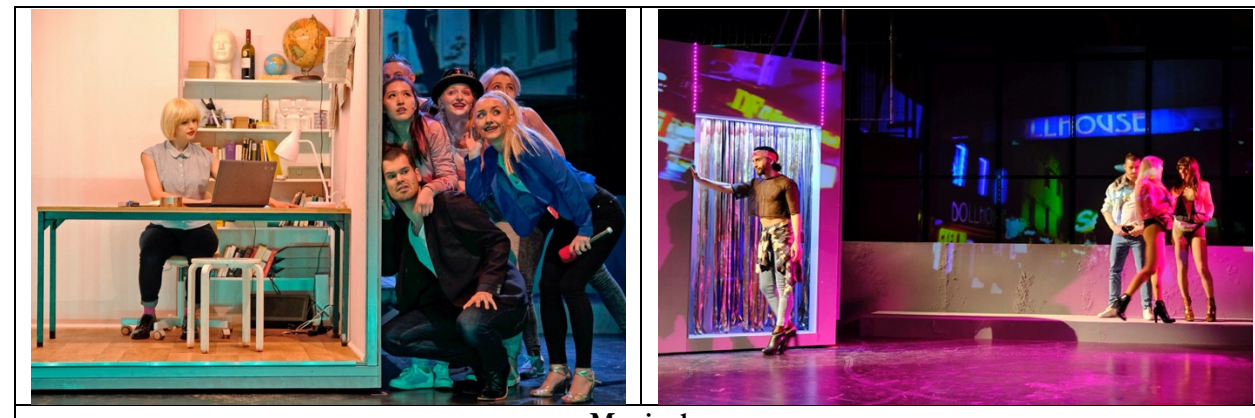
Musical WELCOME TO HELL

Youth choir and choir of the Camerloher-Gymnasium High School, Germany 2020 Performed without audience due to COVID-19 Pandemic