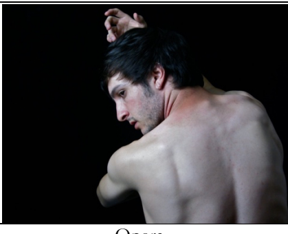
Opera EL CANGURO California International Theater Festival, 2011