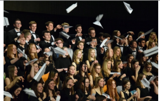
A Dramatic Choral Cantata for Change NIA WA JA SHU – MAKE THE WORLD NEW

Youth choir and choir of the Camerloher-Gymnasium High School, Germany 2020 Performed without audience due to COVID-19 Pandemic