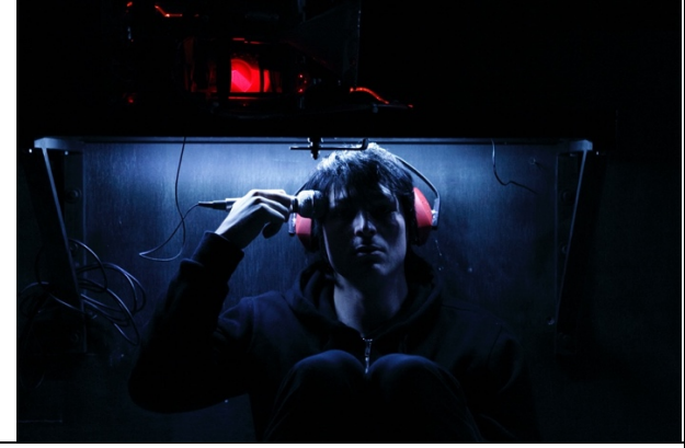
Youth Opera KLANGWANDLER Neuköllner Opera Berlin, 2011